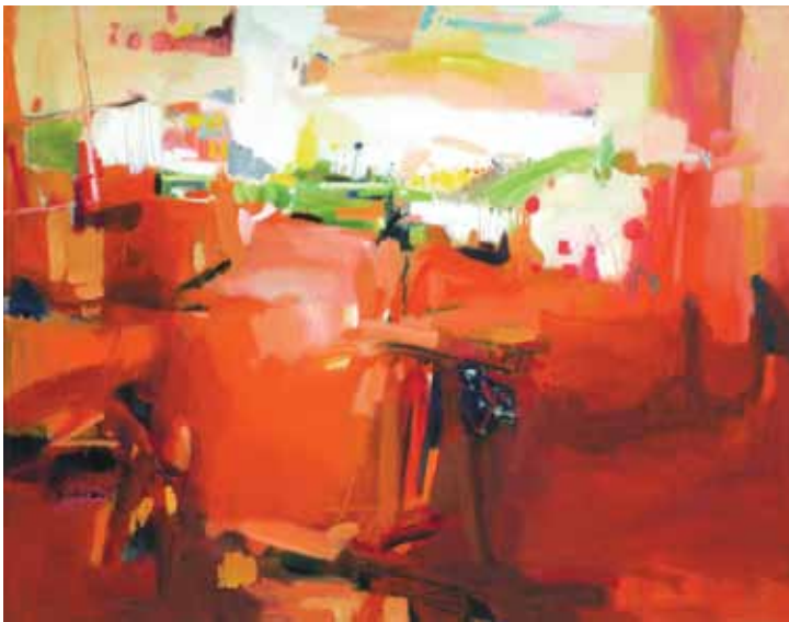
Flow Out by Kuan-Hui Lu

Learn about Taiwan and The Da Dun Fine Arts Exhibition of Taichung City